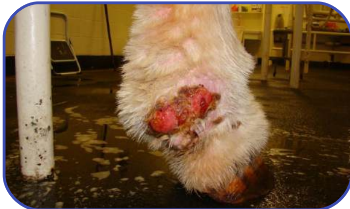
Fig 8. Left hindlimb leg wound on March 9, 2011 (91 days post-op).