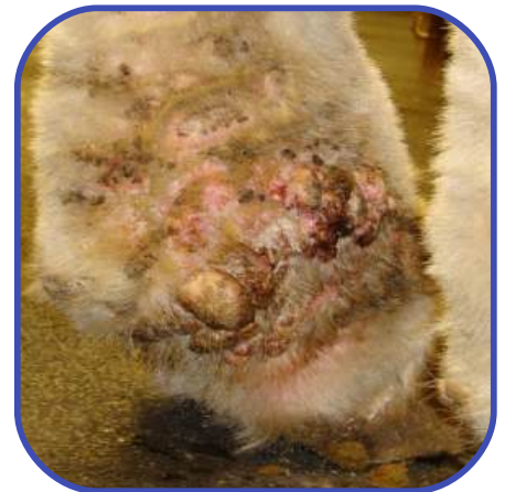
Fig 2. Left hindlimb at presentation.