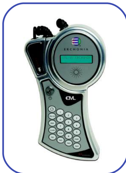
Fig 6. LLLT device used to treat patient.

clinical impression was favorable because the wounds demonstrated excellent contraction and epithelialization without exuberant granulation. Clinical efficacy has not been documented in the literature. 8 Although these results are anecdotal, we feel LLLT has great potential in wound management. The physiologic mechanism of LLLT is stimulation of enzymes in the electron transport chain that increase ATP production. The increase in cellular activity at and around the wound enhances wound healing. The use of LLLT for wound treatment in human medicine is well documented; its use in veterinary medicine has not been extensively documented. In the future, LLLT could become a common modality for treatment of equine wounds.