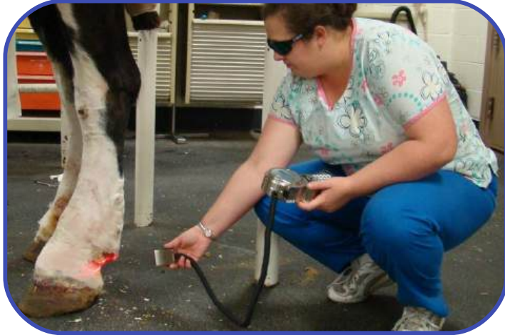
Fig 7. Application of LLLT to the left distal hindlimb wound.