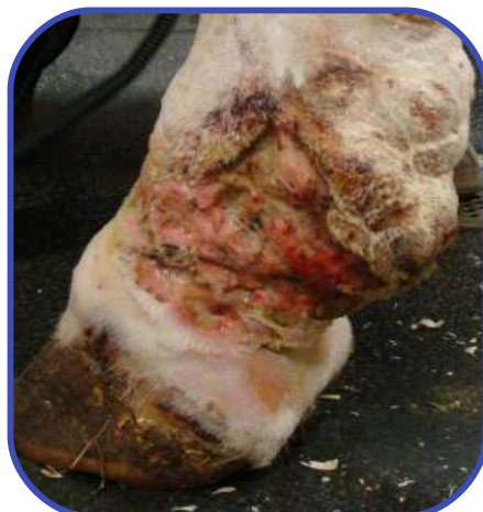
Fig 5. Right hindlimb post-operatively.