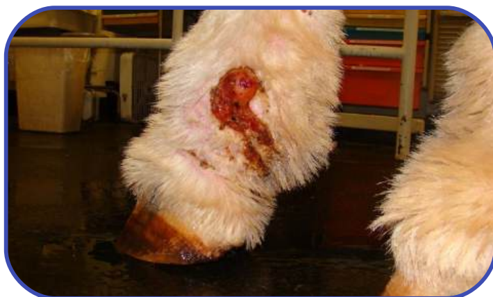
Fig 9. Right hindlimb wound on March 9, 2011 (91 days post-op).