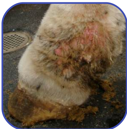
Fig 3. Right hindlimb at presentation.

distally to the coronet (Fig.2 and 3). The exact duration and progression of the condition as well as her previous medical history was unclear at the time of presentation because she had recently been rescued by the owners. Aside from the bilateral distal hindlimb masses, no additional significant findings were noted on physical exam.