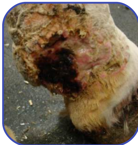
Fig 4. Left hindlimb post-operatively.

performed. The LLLT device was a 7.5 milli Watt dual diode, 635 nm, constant wave 3b medical laser a (Fig. 6). All ANSI laser safety guidelines for use of lasers on health care facilities (Z136.3) were closely observed. LLLT consisted of 5 minutes over the wounds, 3 minutes over the distal limb and 3 minutes over the nerve root (L3) (Fig. 7). Epithelialization and contraction were documented photographically daily (Fig 8 and 9).